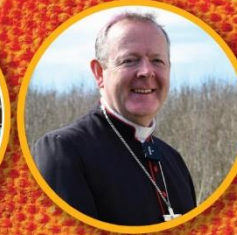
Archbishop Eamon Martin